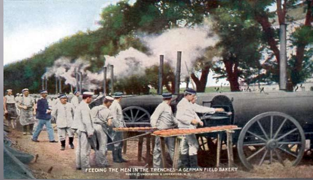
FEEEDING THE MEN IN THE TRENCHES - A GERMAN FIELD BAKERY